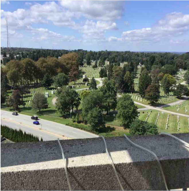
Amenity Name: BathRHB