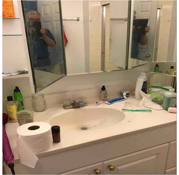
Amenity Name: BathRHB