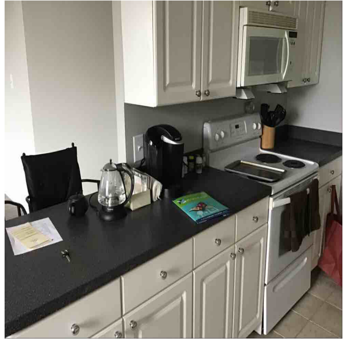
Amenity Name: Campus View