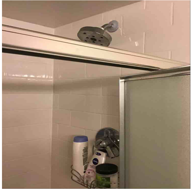
Amenity Name: Campus View