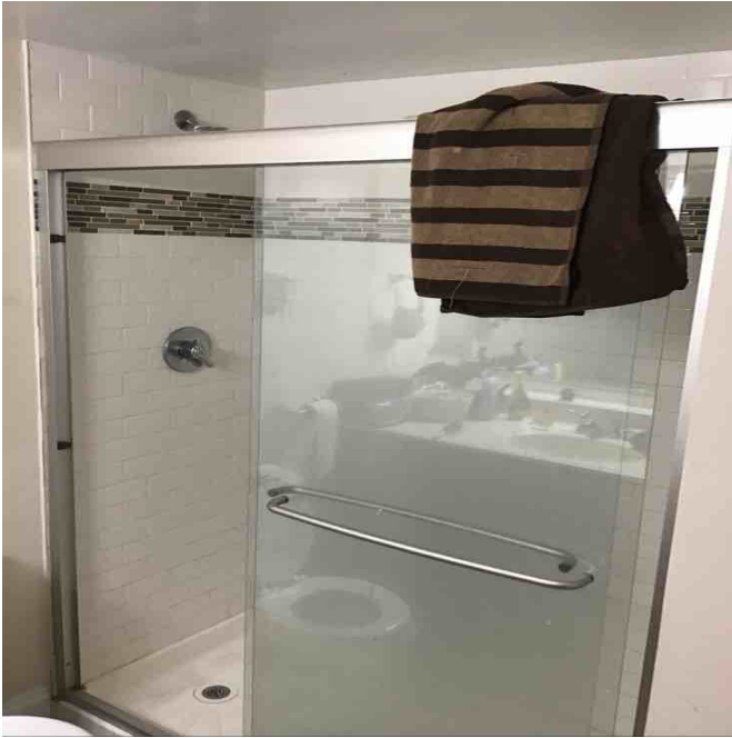
Amenity Name: Updated Tub2