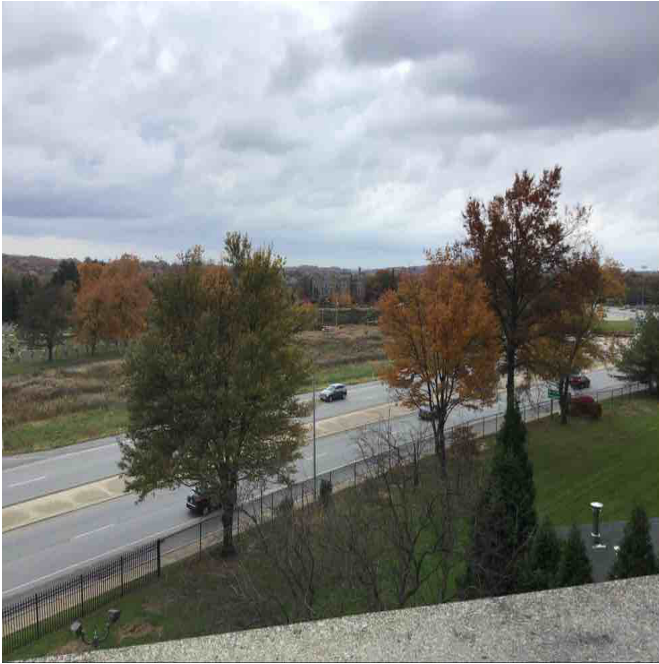
Amenity Name: BathRHB