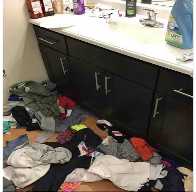
Amenity Name: BathRHB