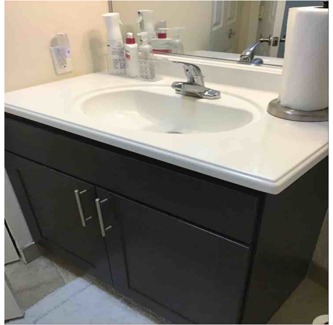
Amenity Name: BathRHB