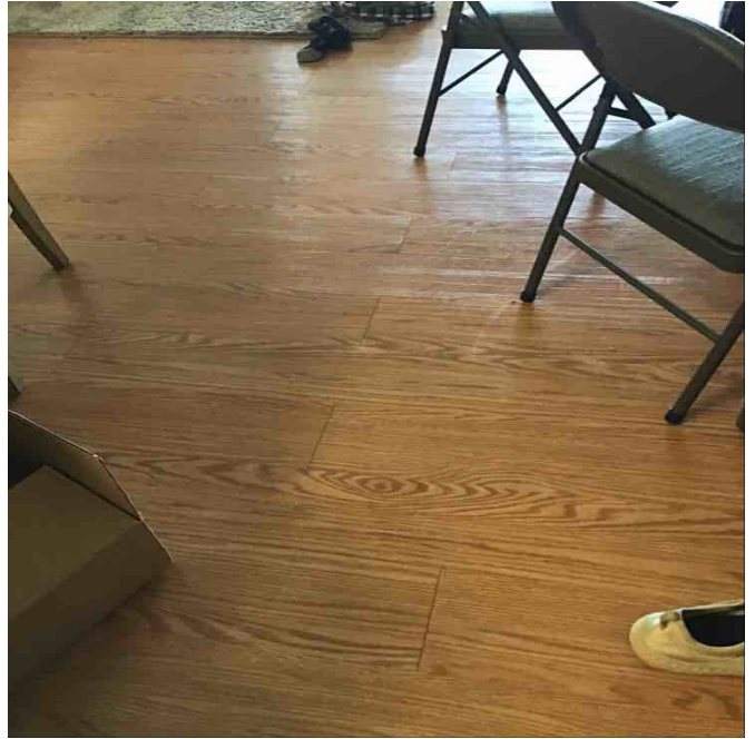
Amenity Name: Campus View