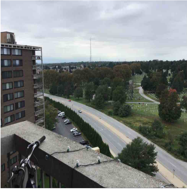
Amenity Name: Campus View