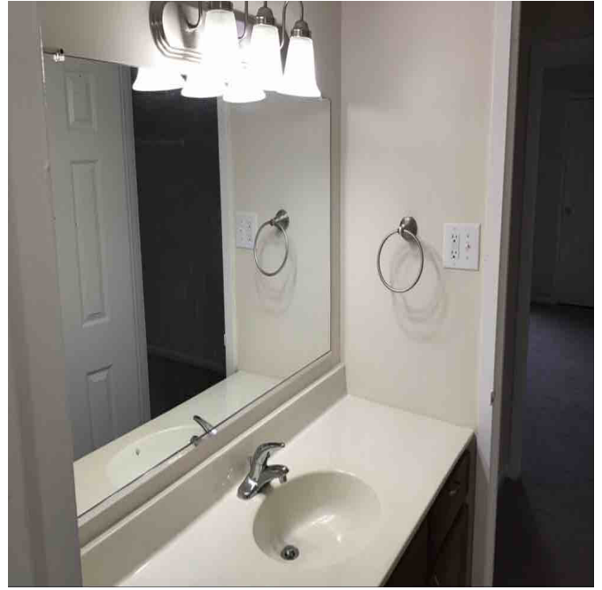
Amenity Name: Lindy Upgrade 2