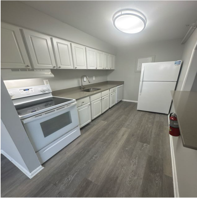
Amenity Name: Plank in Full Unit