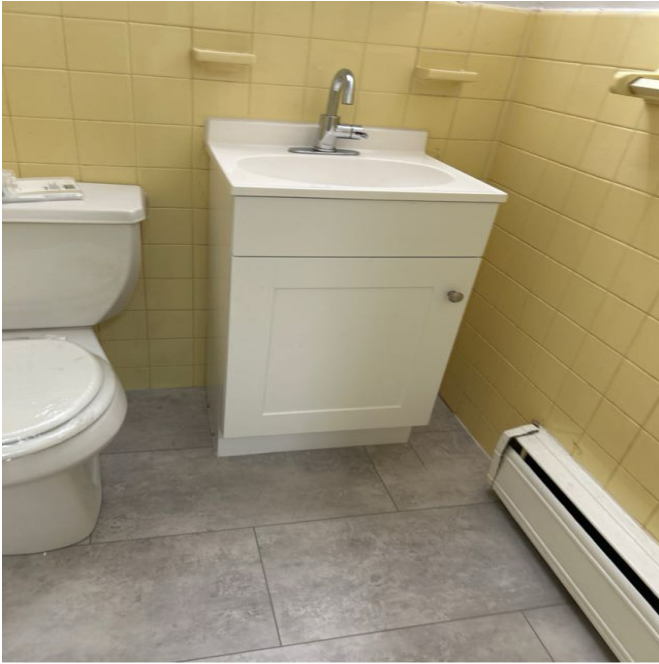
Amenity Name: Bathroom Upg-light