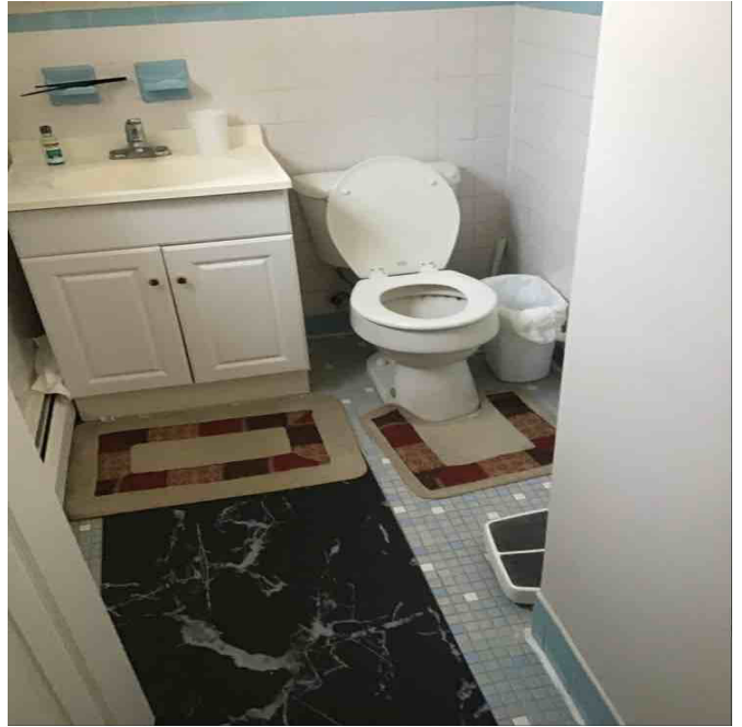
Amenity Name: View (Neg)