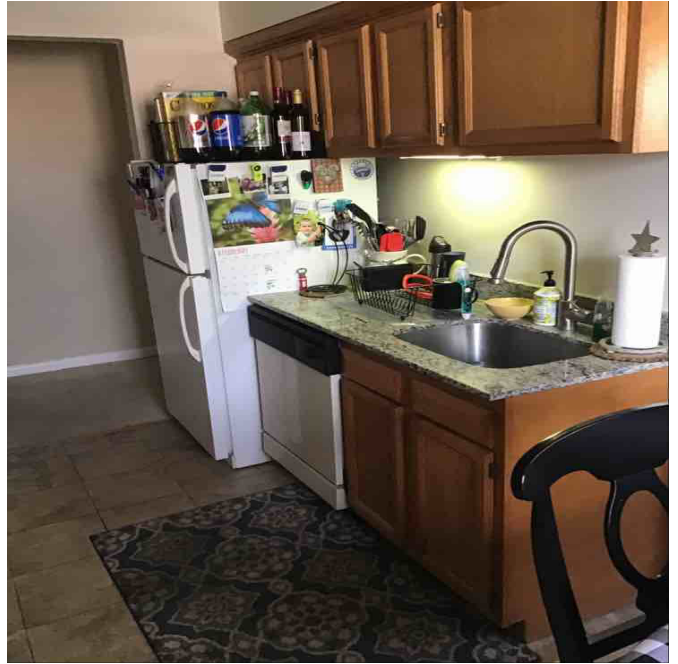
Amenity Name: View (Neg)