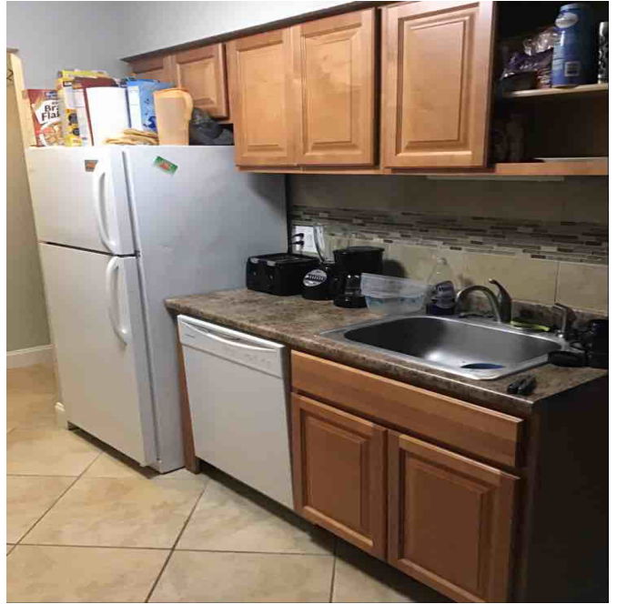
Amenity Name: Courtyard View