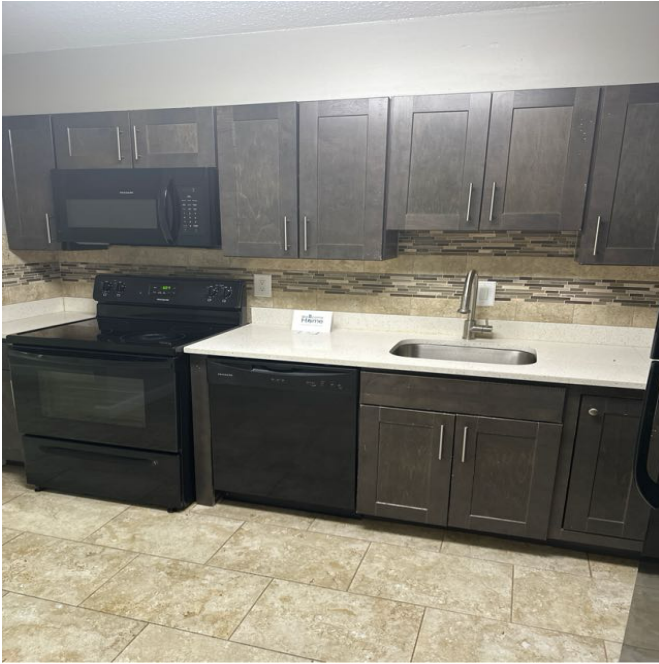
Amenity Name: Partial Plank Flooring