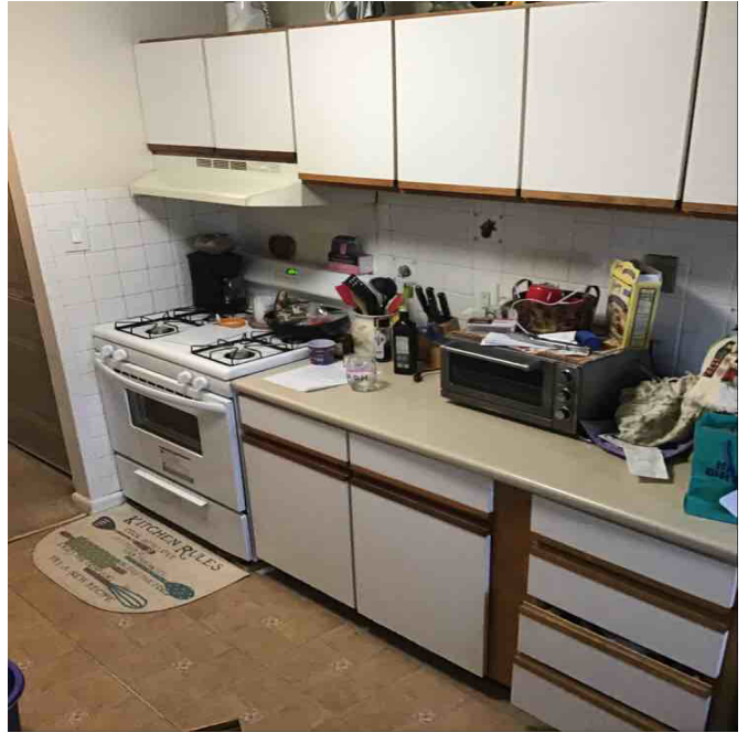
Amenity Name: Courtyard View