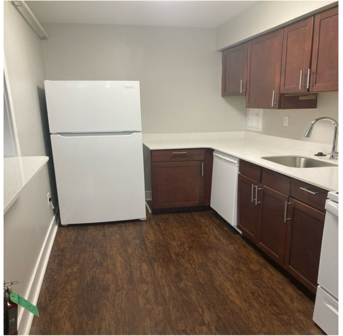
Amenity Name: Quartz Countertops