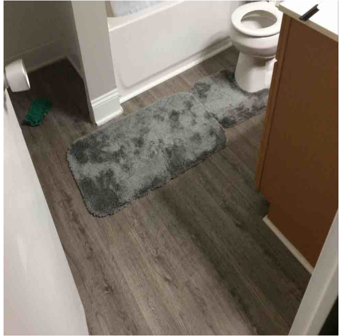
Amenity Name: Campus View