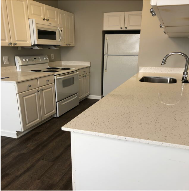
Amenity Name: TriIW