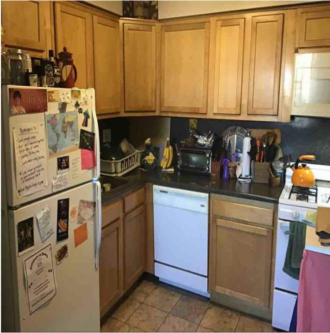
Amenity Name: View (Neg)