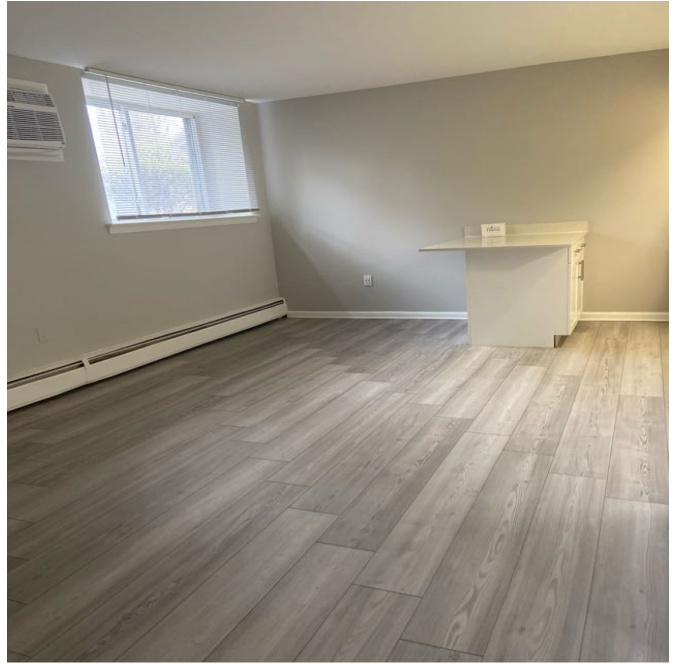
Amenity Name: Quartz Countertops