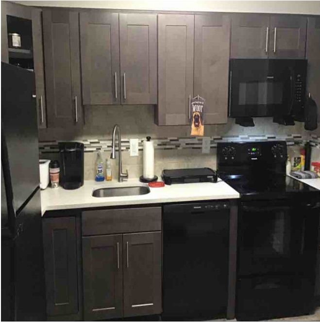
Amenity Name: Plank Floors