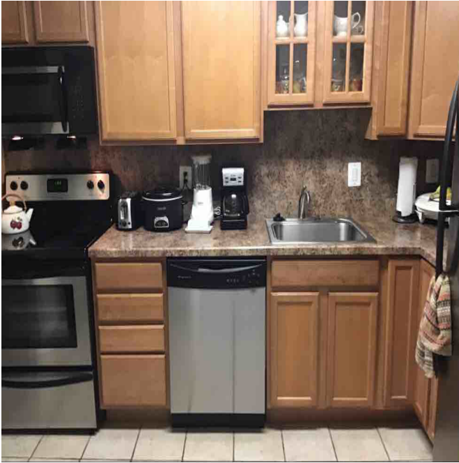
Amenity Name: Private Entr