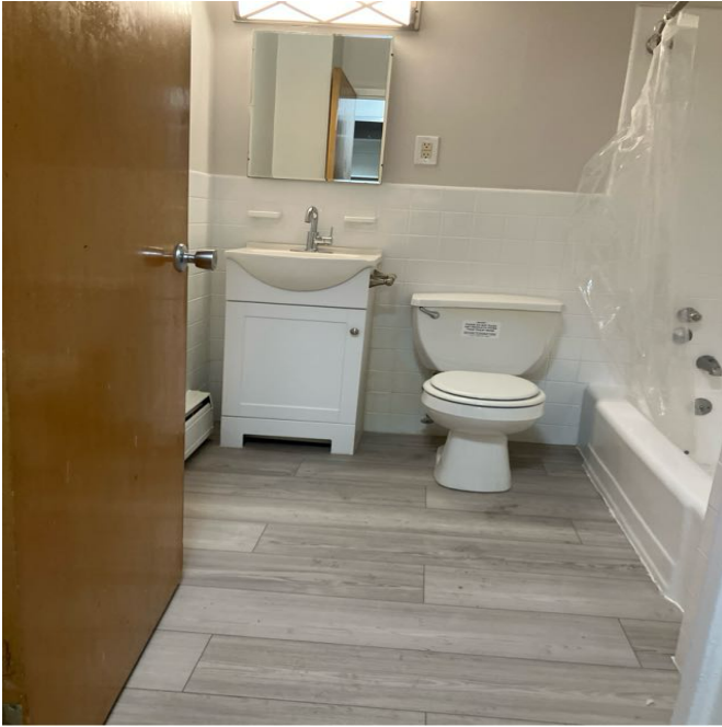
Amenity Name: View-Pos1